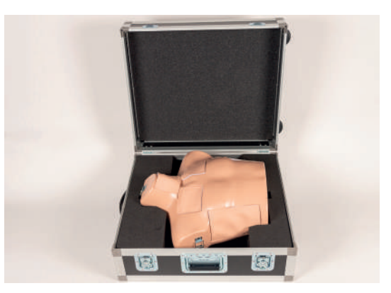
Solid travel case provides compact storage and safe transport