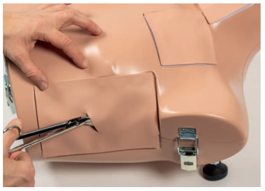
Chest Tube Insertion Very realistic with lung feature, multiple foam layers and correct rib separation