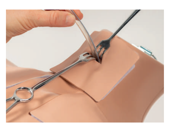
Cricothyroidotomy Great anatomical design and excellent performance