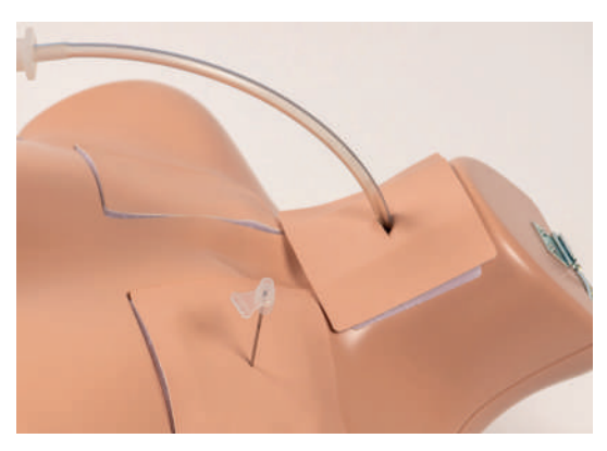
Needle Thoracentesis The ribs and clavicle must be palpated for correct entry point