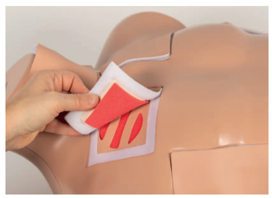
SYNMAN Compact is set up and ready tu use in less than 5 minutes