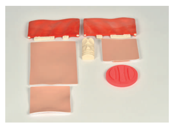
Replacement parts can be quickly and easily changed without the use of tools. Available in sets for 8, 16 or 20 participants